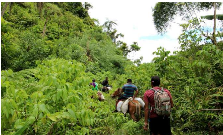
Riding on horseback to get to and from remote villages in Naitasiri

The mobile service team delivered 217 services (127 women and 90 men). The Department of Social Welfare delivered 105 (35 to women and 70 to men); the Department of Women delivered 73 (all to women); and the Legal Aid Commission delivered 39 (19 women and 20 men).