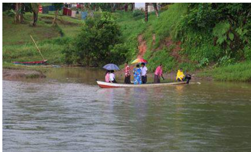
REACH Mobile Service Delivery team traveling to Nauluvatu village