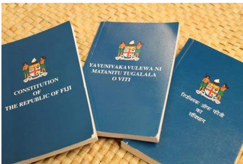
Constitution of the Republic of Fiji in three vernacular languages