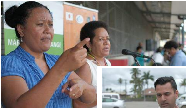
The role of sign language interpreters is crucial for equal access to services.

Fiji ratified the Convention on the Rights of Persons with Disabilities (CRPD) on 7 June 2017. The CRPD adopts a broad categorization of persons with disabilities and reaffirms that all persons with all types of disabilities must enjoy all human rights and fundamental freedoms. Aligning with the aims of the CRPD, the Rights of Persons with Disabilities Bill was