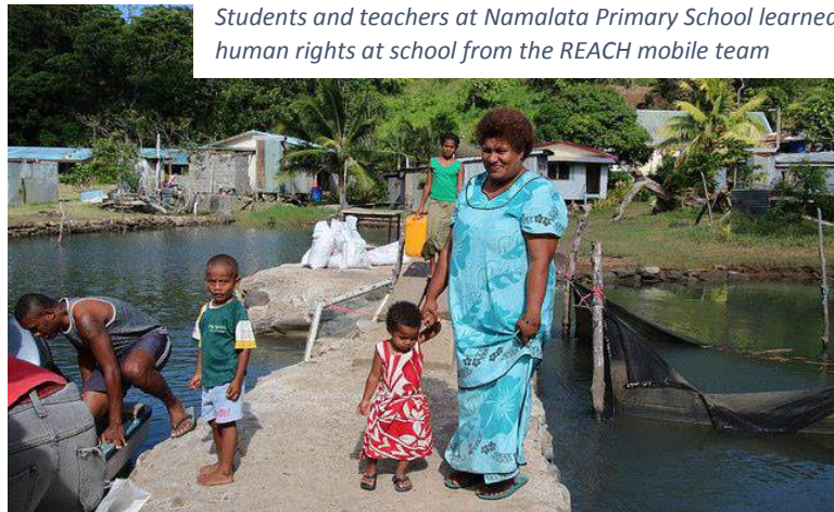
Galoa village, Tavuki District