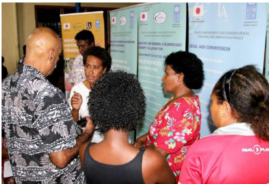
People of Saru community in Lautoka, West of Fiji, during the REACH Mobile Service Delivery Service at their location

http://www.pacific.undp.org/content/pacific/en/home/presscenter/articles/2017/03/13/reaching-the-furthest-behind-first.html