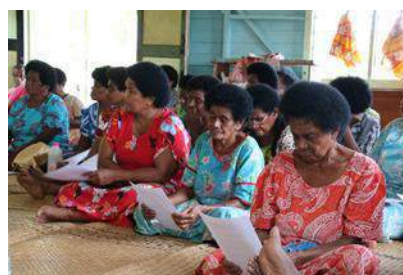
Participants at Lutu village, Wainimala District, Naitasiri Province

She added, "They go to these villages and provide their services to the communities rather than having them come to the main city which they find very difficult to do."