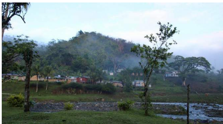
Nasava village, Wainimala District, Naitasiri Province