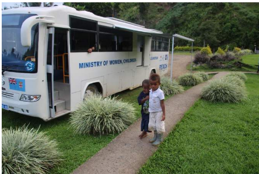
REACH mobile service delivery bus at Naraiyawa village, Naqarawai district of Namosi province.

empowerment of all women and girls. The REACH Project supports the achievement of these goals.