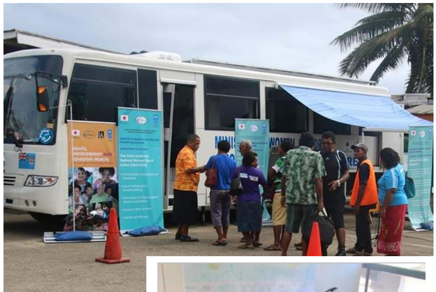
Villagers arrived in numbers to take advantage of the services provided by the REACH bus mobile office.

and Poverty Alleviation, and the Legal Aid Commission with support from the Government of Japan and UNDP.