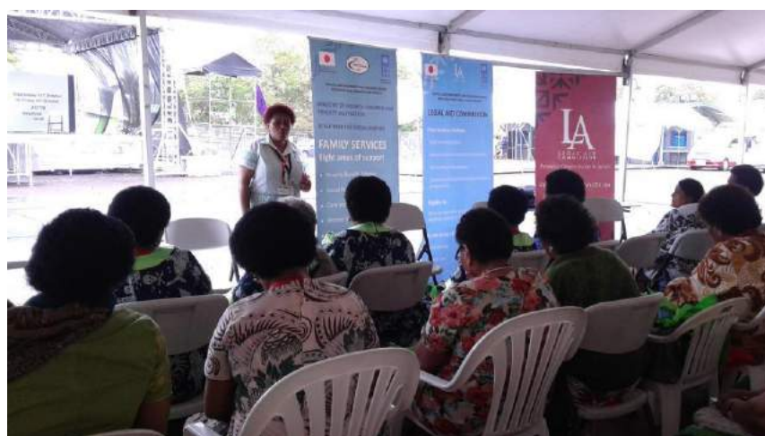
REACH awareness raising and service delivery session during Expo

year's observance of the International Day of Rural Women falls just after last month's landmark adoption by world leaders of the 2030 Agenda for Sustainable Development. Our challenge now is to seize the opportunity offered by this inspiring new framework to transform rural women's lives.”