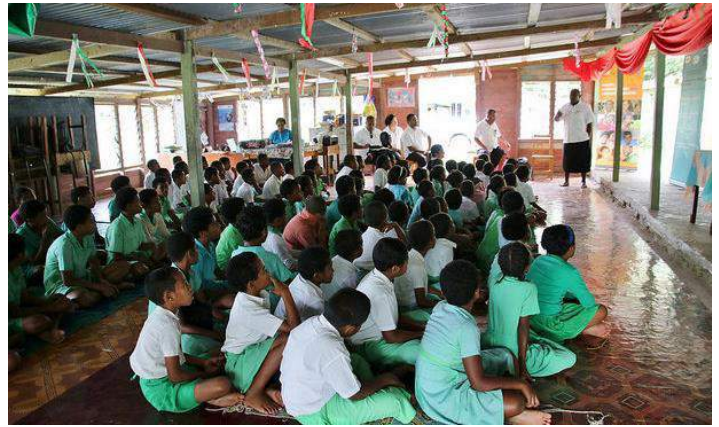
Students and teachers at Namalata Primary School learned about human rights at school from the REACH mobile team

The REACH project aims to increase people’s awareness about their constitutional rights and deliver social, economic and legal services provided by the Ministry and the Legal Aid Commission at their doorsteps.