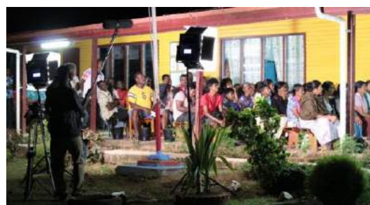
Production of the REACH advocacy video was carried out during the REACH mobile service delivery mission.

The Rights, Empowerment and Cohesion (REACH) for Rural and Urban Fijians Project, aims to promote peacebuilding, social cohesion and inclusiveness through awareness of rights, access to services, provision of legal advice and institutional capacity building in Fiji. The three-year REACH Project is being implemented by the United Nations Development Programme (UNDP) in partnership with the Ministry of Women, Children and Poverty Alleviation and the Legal Aid Commission and supported by the Government of Japan and UNDP.