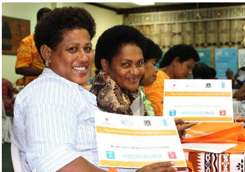
Participants from the Eastern Division received the certificate of participation at the end of the workshop.

She added, “I wish to remind you that it is your right to be safe, protected and to have access to justice through legal services. I hope you have taken good note of the services that are available for you and all Fijian women and that you will help anyone in need