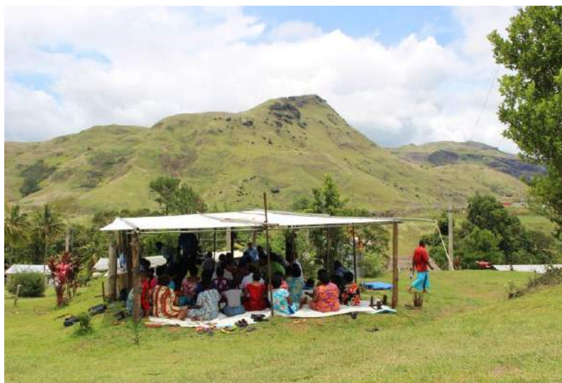
REACH mobile awareness raising and service delivery session at Buyabuya village, Savatu District, Ba Province.

International Day of Persons with Disabilities which is 3