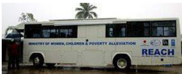
The REACH Project Bus was introduced on 15th December 2016 by the Ministry of Women, Children and Poverty Alleviation in support of the Mobile Service Delivery

peace building, social cohesion and inclusiveness through awareness of rights, access to services, provision of legal advice and institutional capacity building in Fiji.