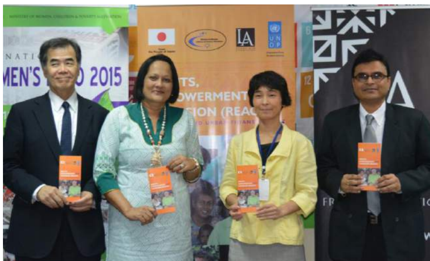
The REACH project supporting the Fiji National Women's Expo

Also during Expo on Thursday 15 October the International Day of Rural Women was celebrated. In his message, the UN Secretary General, Ban Ki-Moon said, “this