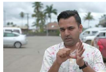
Director of the FAD, Krishneer Sen advocate for the provision of sign language interpreters for equal access to services.

It supports the achievement of Sustainable Development Goal (SDG) 16 which highlights UNDP’s commitment to promote peaceful and inclusive societies for sustainable development and to provide access to justice for all, to build effective, accountable and inclusive institutions at all levels. It also promotes SDG 5 which seeks to achieve gender equality