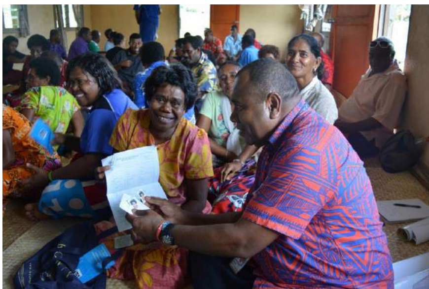
Women obtaining more information as group and individuals during the REACH mobile service delivery to people in Nubu, Nabukebuli, Nabutubutu, Naikelikoso and Wainaidru villages

The 2030 Agenda for Sustainable Development Goals launched on 1 January 2016 with 17 goals, addresses the needs of people in both developed and developing